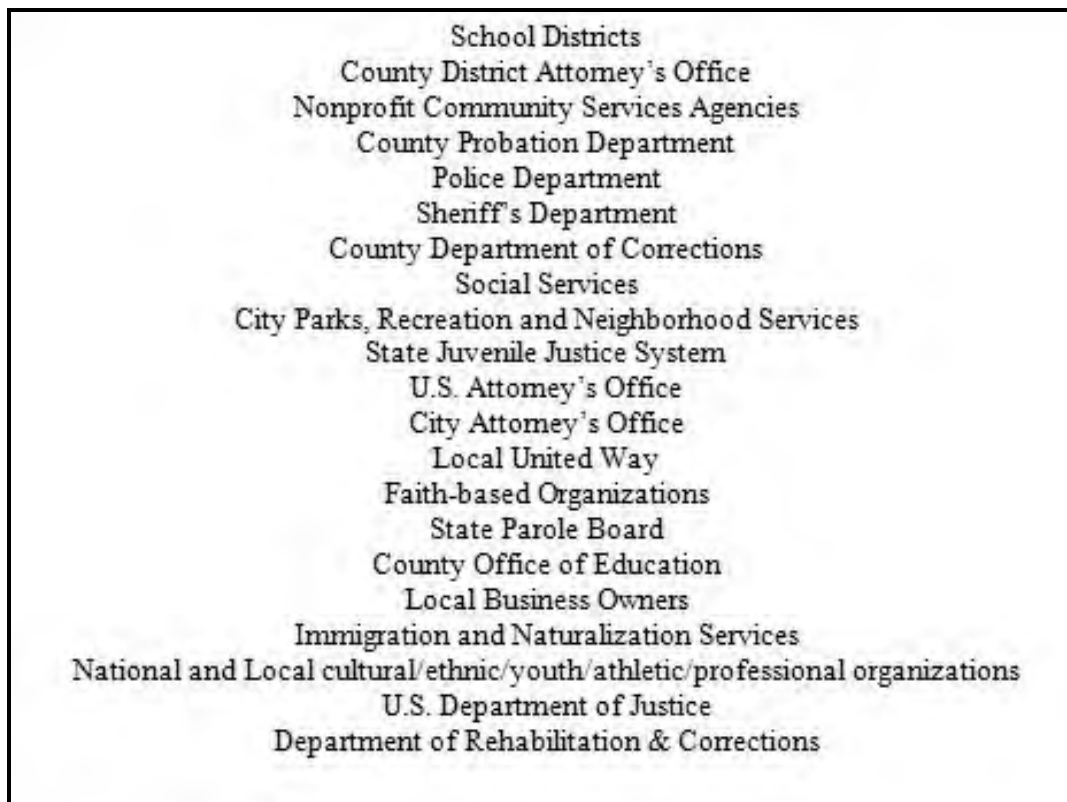
Figure 2. Sample Agencies and Organizations

state parole office and U.S. Attorney.” 104 For a sample of agencies and organizations that can be involved in COP planning, see Figure 3.